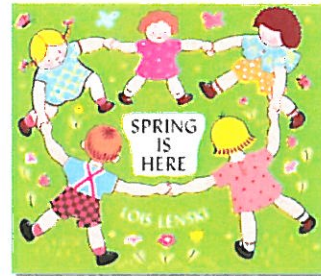
Spring is Here by Lois Lenski